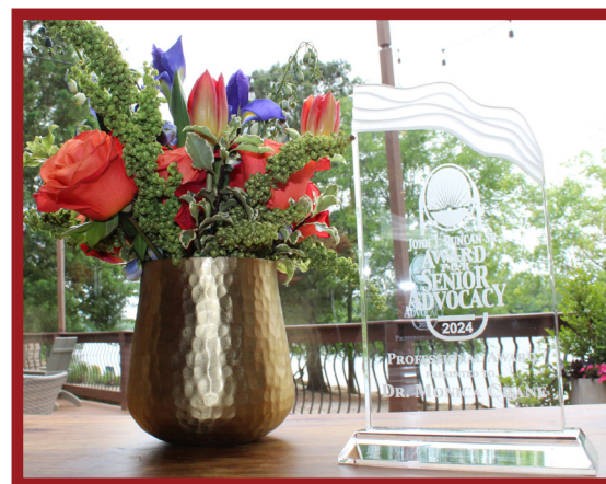
Duncan Award for Senior Advocacy

Would you like to nominate someone to receive the Duncan Award? Nominees must reside, work, or volunteer in Knox County and exhibit outstanding advocacy for seniors and senior issues. Nominations are solicited from the public each fall and should be mailed to Duncan Award Nominee, SIR, P.O. Box 51650, Knoxville TN 37950-1650.